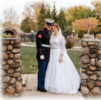
And to bring flowers for May Crowning.