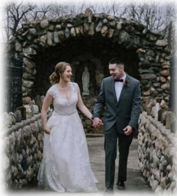
Couples walk over for a visit after their wedding ceremony.