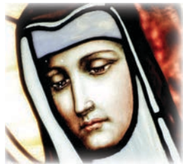
Juliana of Falconieri 1270-1341

Juliana was the only child of a wealthy couple in Florence, Italy, who had built the church of the Annunciation there. She refused to marry and was enrolled as a tertiary with the Servite order; her uncle, St. Alexis Falconieri, was one of the seven founders of the Servites. For nearly 20 years, Juliana lived a devout and useful life at home. In 1304 she formed a community of tertiary sisters who devoted themselves to prayer and good works in Florence. She is considered the foundress of the Servite community of nuns, and was canonized in 1737.