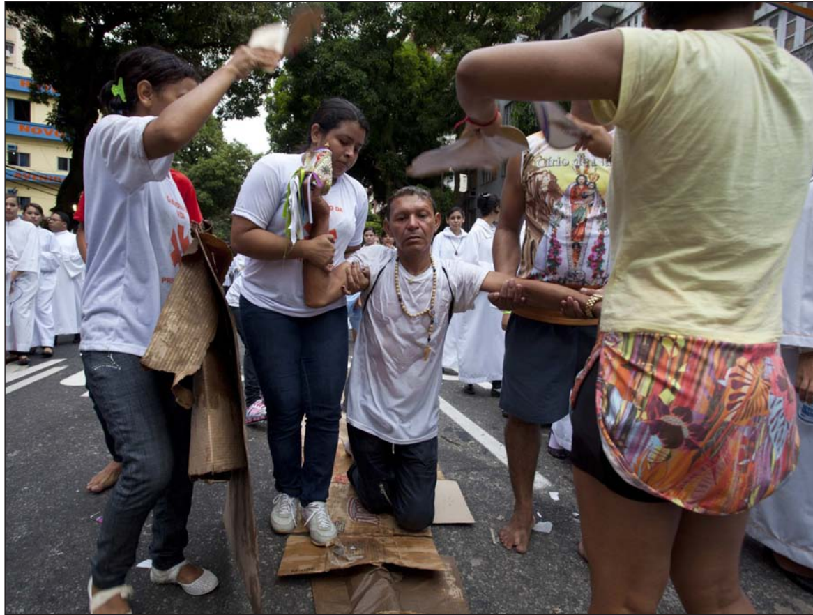
A pilgrim arrives on his knees at Our Lady of Nazareth Basilica during the annual Cirio de Nazare procession in Belem, Brazil, Oct. 13. More than a million pilgrims take part in the procession, which takes place on the second Sunday of October.