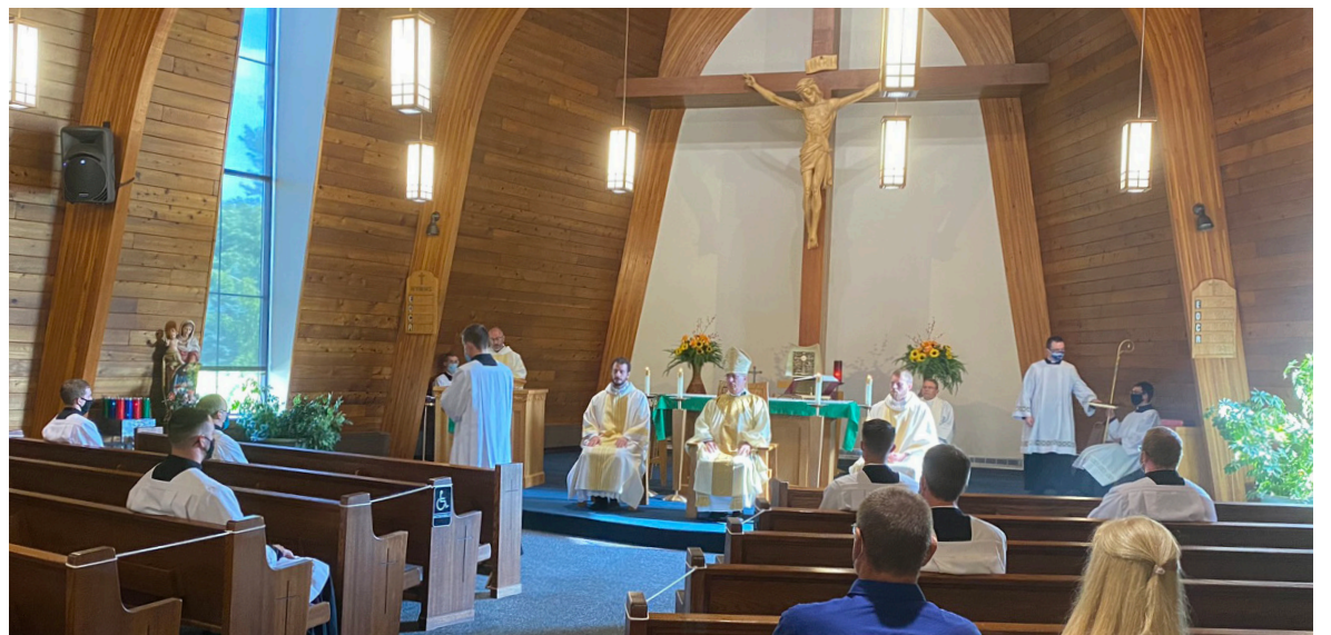
A Mass with Institution of Acolyte and Lectors was celebrated Aug. 3 at St. Martin de Porres Church, Syracuse.

“Their spiritual sharing was then the foundation for their material sharing of goods,” he told them. “All these things remain crucial for the life of the Church. I mention this today since two elements of the Church’s life are highlighted in this Mass with the institution of lectors and an acolyte: the commitment to the teaching of the apostles, which comes to us through the Sacred Scriptures, and the celebration of the Eucharist, the breaking of the bread, the very heart of the