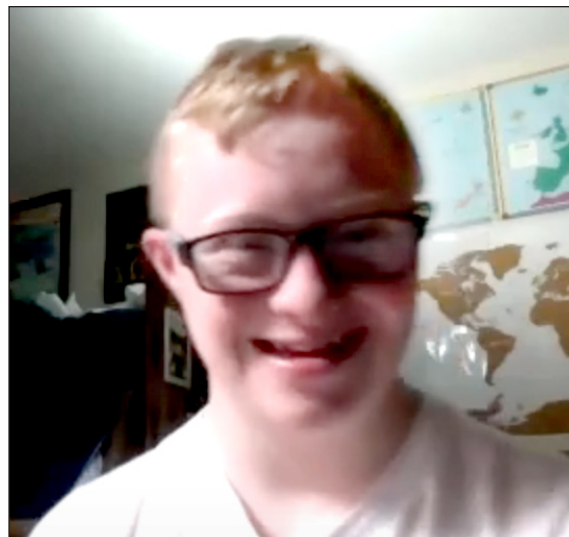
Screenshots from YouTube