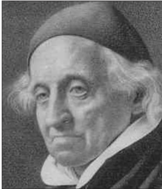
University of Notre Dame