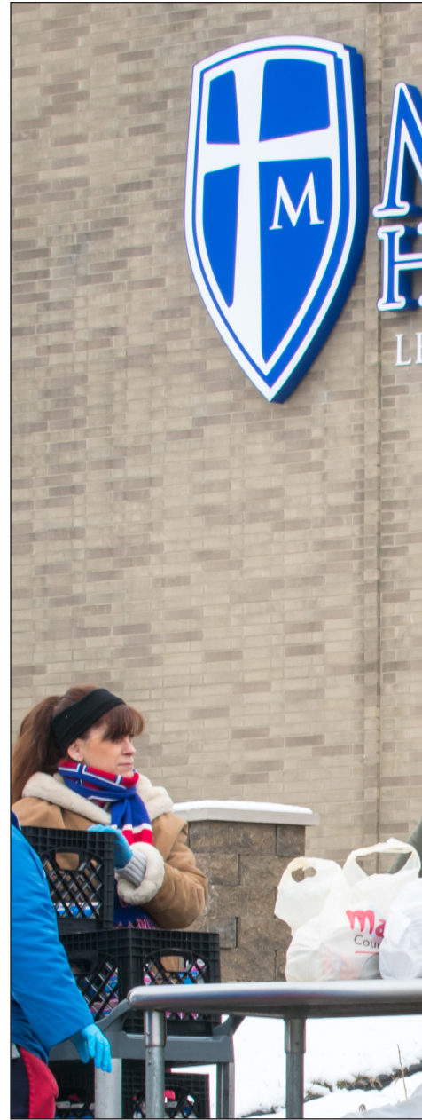
Marian High School cafeteria staff provide drive-through groceries offered at no charge to everyone who requests.

For a list of how to view Masses and devotions on television and online, see page 12.