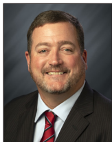
REP. CHUCK GOODRICH

To follow priority legislation of the ICC, visit www.indianacc.org . This website includes access to I-CAN, the Indiana Catholic Action Network, which offers the Church's position on key issues. Those who sign up for I-CAN receive alerts on legislation moving forward and ways to contact their elected representatives.