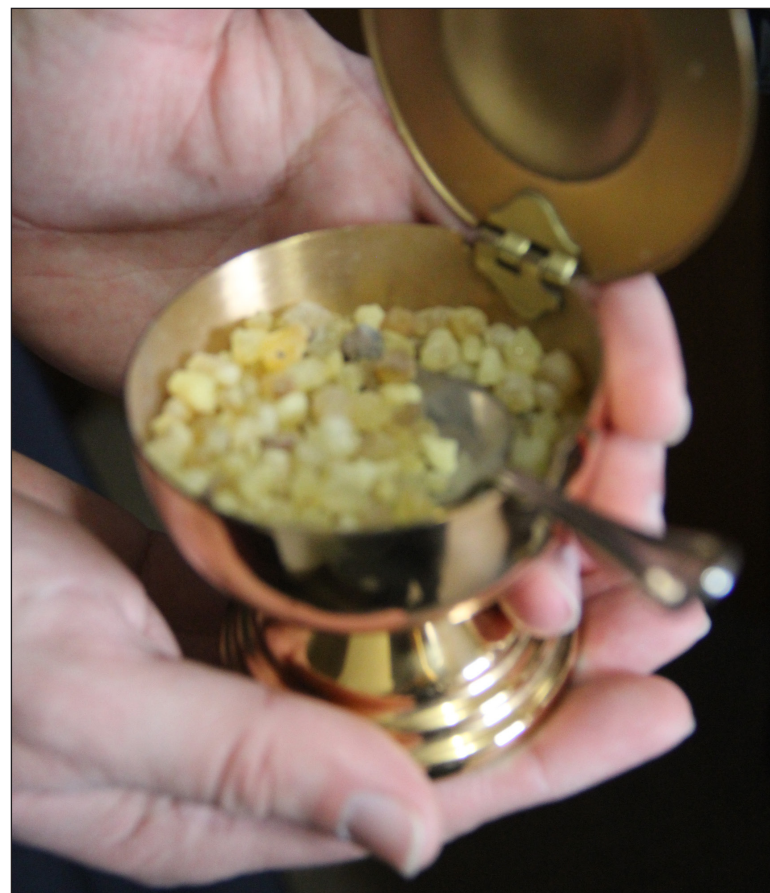
Frankincense pellets lay inside what is known as an incense boat, with spoon.

While Lent may call for a decreased use of incense, it is fitting for Catholics to use at home the sacred forms of worship, such as burning incense, during the Easter season to honor Jesus' triumph over death.