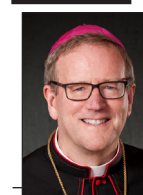
BISHOP ROBERT BARRON

If you can make it through the plethora of obnoxious, juvenile, and insulting comments, you will actually learn a great deal about what is on the minds of the Reddit audience -- mostly young men between the ages of