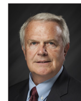
REP. GREGORY STEUERWALD

To follow priority legislation of the ICC, visit www.indianacc.org . This website includes access to I-CAN, the Indiana Catholic Action Network, which offers the Church's position on key issues. Those who sign up for I-CAN receive alerts on legislation moving forward and ways to contact their elected representatives.