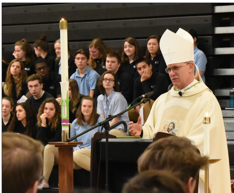
Bishop Rhoades addresses the student body during his homily, challenging the young men present to model themselves after St. Joseph and the young women to look for such men.