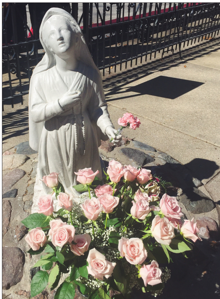
A vase of pink roses and baby's breath is a gesture by parents of entrusting their children to Mary. The flowers were placed at the Lourdes Grotto at Notre Dame during a day retreat offered by "ava's grace," a diocesan ministry offered for those who have suffered the loss of a baby before or after birth.