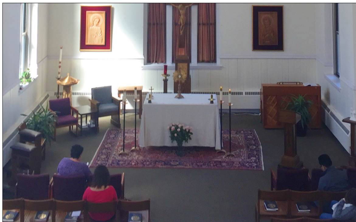
Participants pray in Sacred Heart Parish Chapel, Notre Dame, during the retreat.