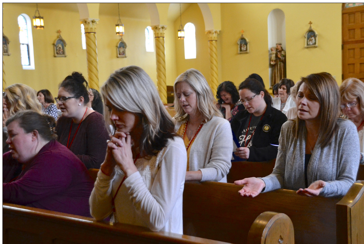
Participants in a women's Cursillo weekend at St. Felix Catholic Center, in Huntington, pray during Mass on Sunday, March 24, the final day of the weekend.

The final day of the retreat fell on the eve of the feast of the Annunciation of Our Lord, when