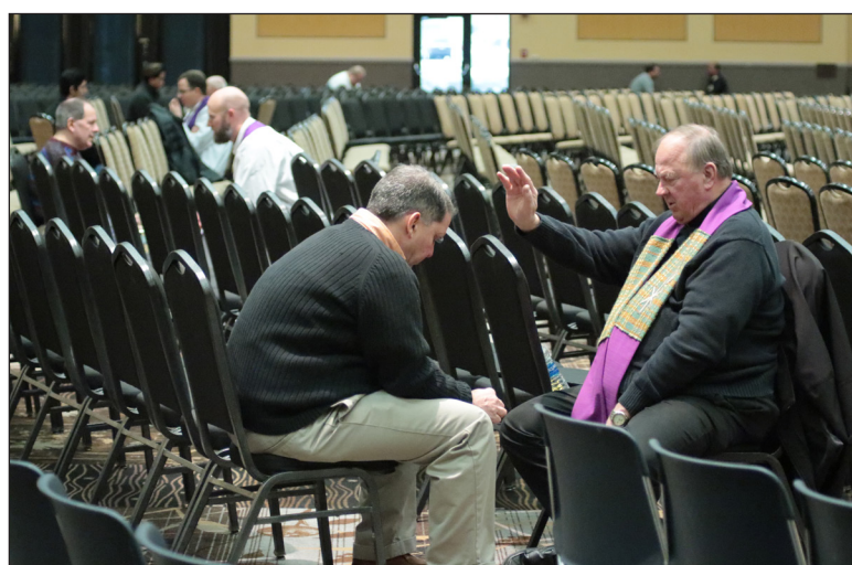
At top, the Rekindle the Fire cross is carried in at the start of Mass. Below, participants take advantage of the opportunity to obtain the sacrament of reconciliation, which was offered throughout the day.