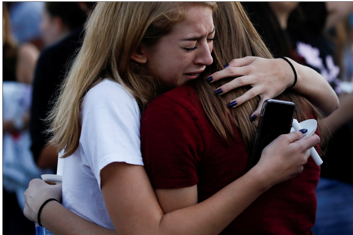
Students mourn during a candlelight prayer vigil Feb. 15 for the victims of a mass shooting at nearby Marjory Stoneman Douglas High School in Parkland, Fla. At least 17 people were killed in the Feb. 14 shooting. The suspect, 19-year-old former student Nikolas Cruz, is in custody.

Archbishop Wenski added in his statement: "This Ash Wednesday, we begin our Lenten Season that calls us to penance and conversion. With God's help, we can remain strong and reso-