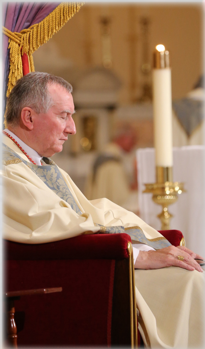
Cardinal Pietro Parolin, Vatican secretary of state, prays during Mass Nov. 12 at the Basilica of the National Shrine of the Assumption of the Blessed Virgin Mary in Baltimore on the eve of the fall general assembly of the U.S. Conference of Catholic Bishops.

They also previewed upcoming events such as the U.S. Catholic Church's Fifth National Encuentro, or "V